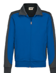
010 royal blue/anthracite